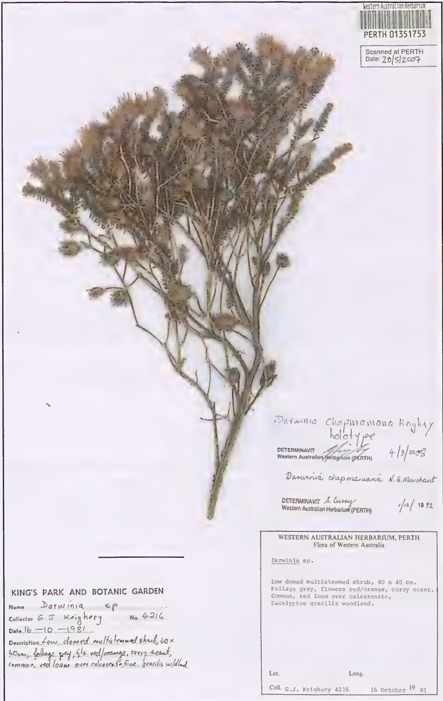
Figure 1. Holotype of Darwinia chapmaniana , scale = 5 cm.